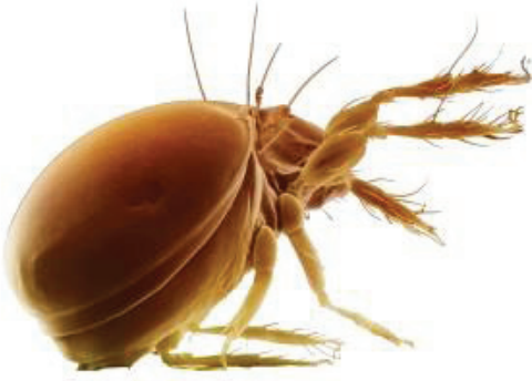
Fig 2. House dust mite

Dust mites are tiny creatures that make their homes in warm, humid, dusty areas such as carpets, mattresses, pillows, and other soft furnishings. Mite allergens can be found throughout the home environment although the greatest numbers of mites are found in carpets, while the highest concentration is in bedding. 12