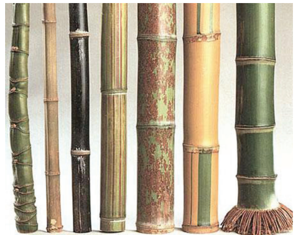
Fig 4. Bamboo species

Certification is slow within the bamboo flooring industry, so it is hard to verify the manufacturers’ processes until it gets to the shop floor.